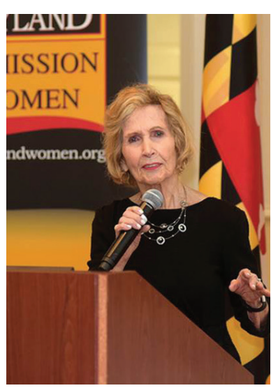
The Honorable Connie Morella